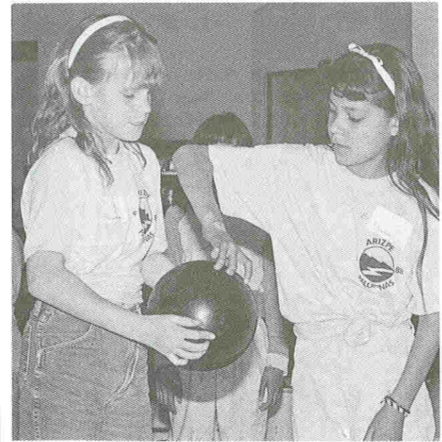
An elementary school student from Herford, Arizona, and her Mexican peer share in one of many HATB extra-curricular activities.